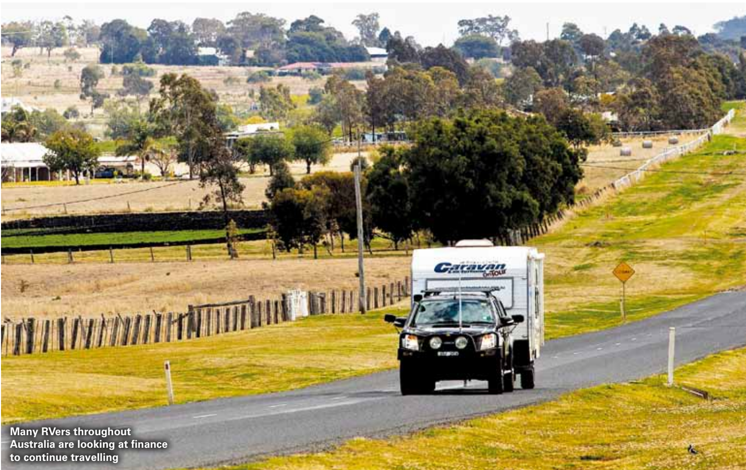
Many RVers throughout Australia are looking at finance to continue travelling

Be sure to get full explanations of any paperwork you may be signing