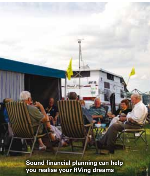
Sound financial planning can help you realise your RVing dreams

For these purposes, it's worth talking to a finance professional before making any commitments that can have you locked into a contract for a long time. Finance is nothing to be scared of, and is a great way to travel our beautiful country in your RV, but due diligence is required to get the results you're after.